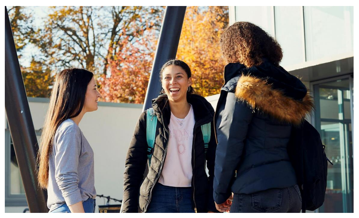
'Get ahead! A masterclass on applying to university', at St Mary's University, Twickenham, Wednesday 2 November 10:30-14:30

Aimed at students aged 16-18 interested in going to uni, this workshop at St Mary's University will give them the opportunity to get ahead of their next steps. It will cover: