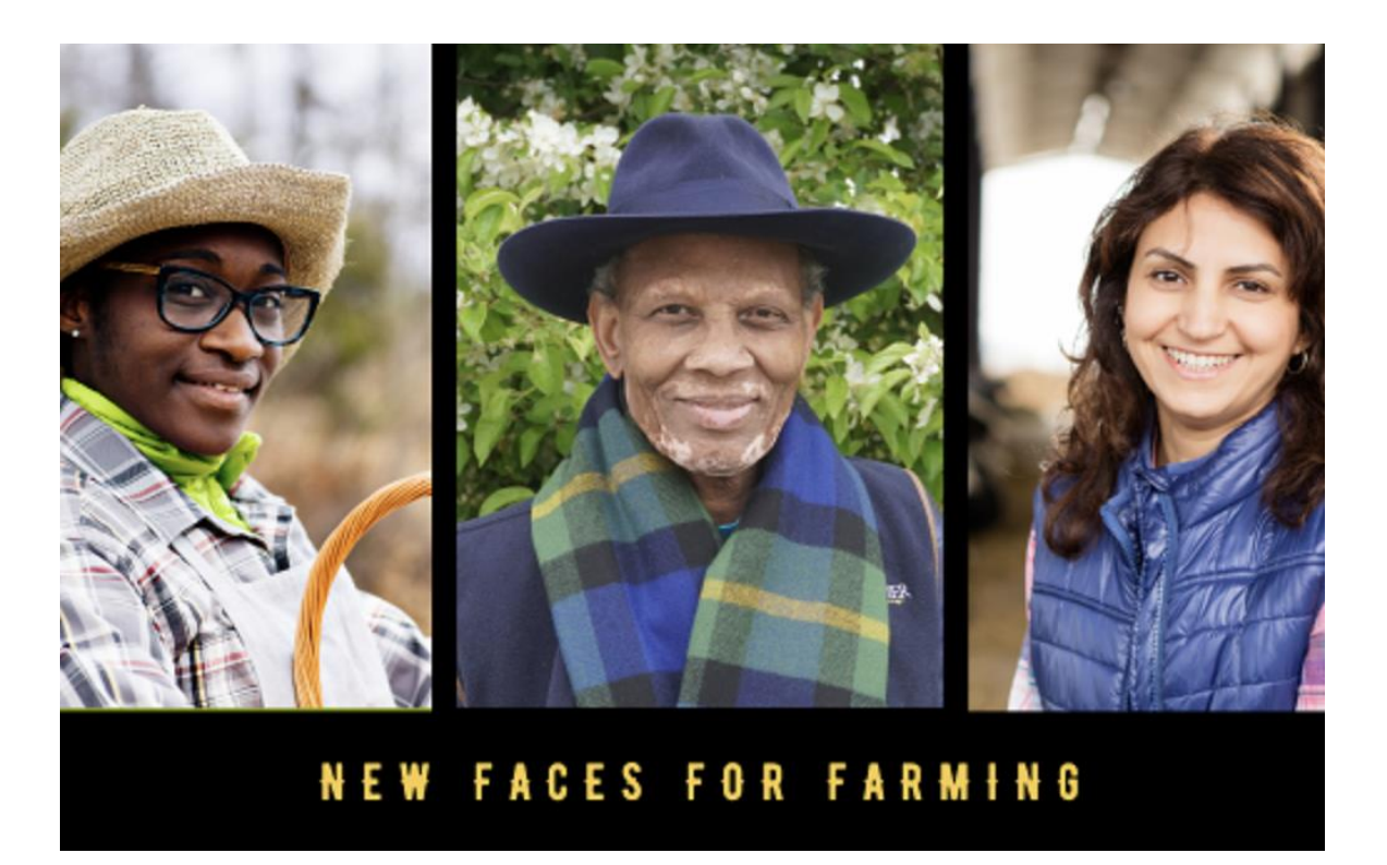
Know a student aged 16-18 who wants to learn more about agriculture?

Food production is a multi-billion-pound sector, yet it's one of the least diverse industries in the UK.